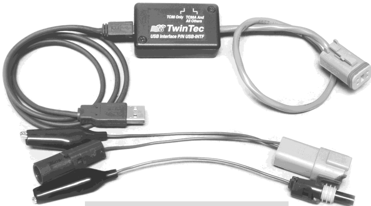
Figure 1 – Twin Tec USB Interface with Adapters

NOTE: You must set the switch to the correct position. Use the TC88 setting for TC88 ignitions with two 12 pin Deutsch connectors only. Use the TC88A setting for all other Twin Tec engine control modules and the Twin Tuner series.